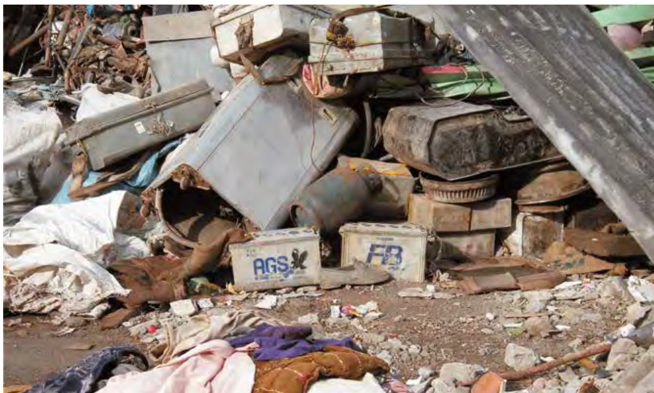
Hazardous waste (car batteries and LPG cylinder) mixed with debris, Balakot 2005.