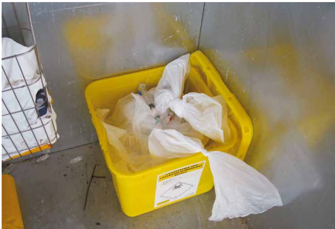
Healthcare waste is segregated and stored in clearly distinguished yellow container awaiting disposal.

Further Resources to support implementation in the field. Please contact the Environmental Emergencies Centre: www.eecentre.org and use the “contact us” button.