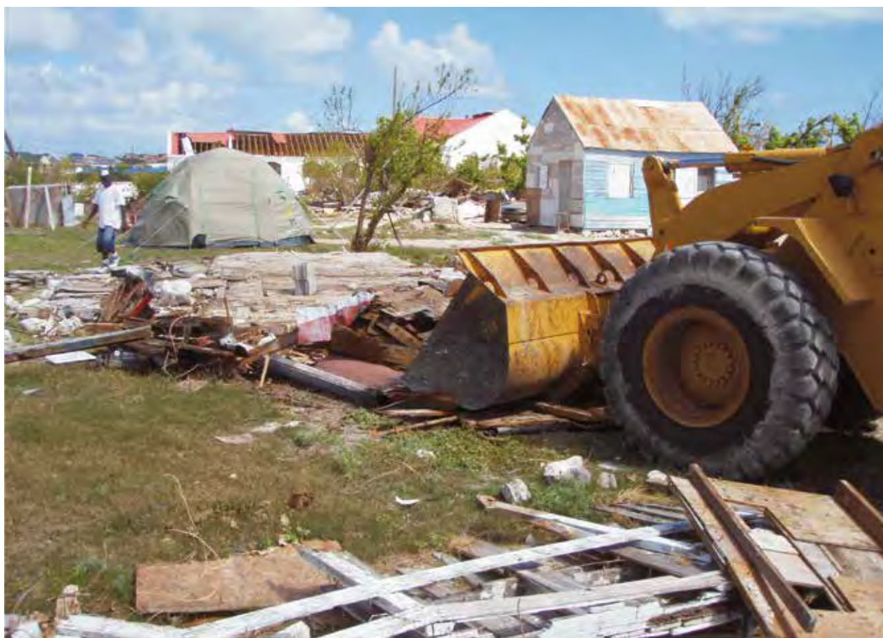
Clearing hurricane debris in post-hurricane Turks and Caicos Island 2008. Note the lack of appropriate equipment to segregate roofing and reusable boards.