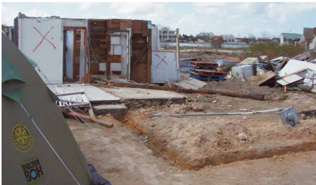
Typical hurricane debris where a roof has been blown off and debris spread over area in post-hurricane Turks and Caicos Island 2008.

Unfortunately, current DW management practice often involves either no action , in which the waste is left to accumulate and decompose, or improper action , in which the waste is removed and dumped in an uncontrolled