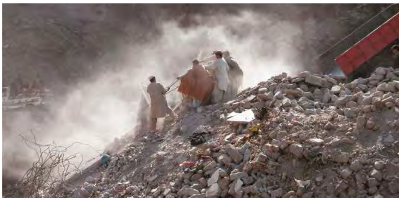
Salvaging scrap metal from post-earthquake debris, Muzaffarabad.