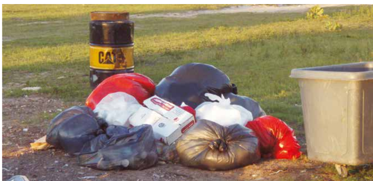
Mixed healthcare waste, including red bags indicating infectious waste, disposed of openly in post-hurricane Turks and Caicos Island 2008.